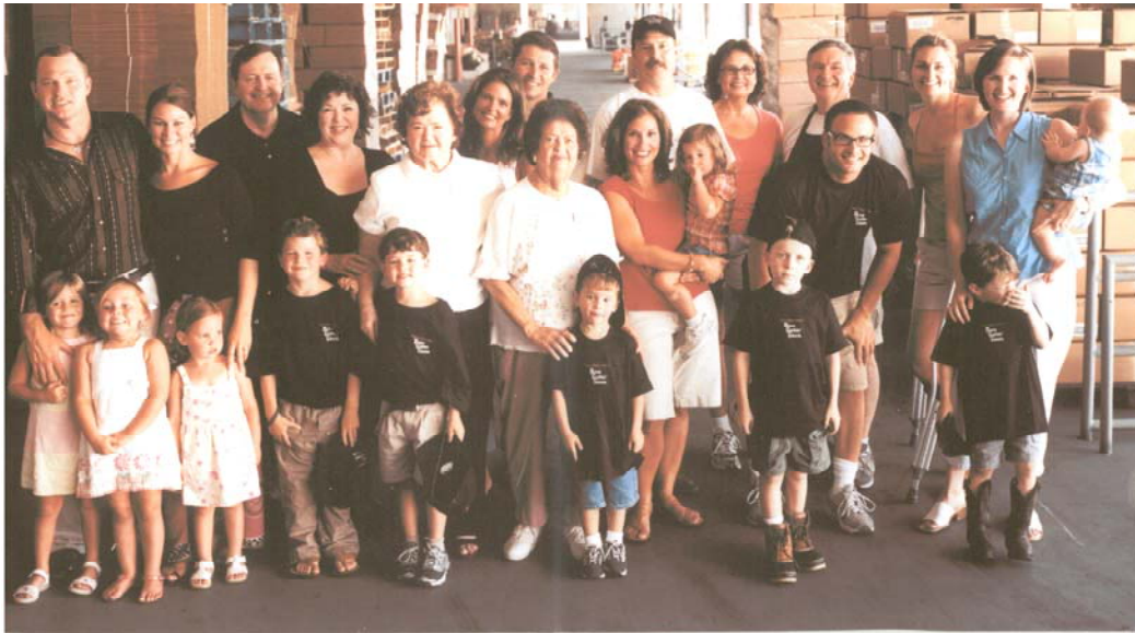
Four generations of the Ford family.

Ford's is a fourth generation family owned & operated business.